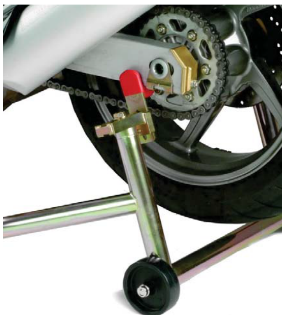
Standard (Rubber Pad)

Push down on handle of stand to lift bike, allowing steel end plug to rest on the ground. If lower cross-bar contacts tire of motorcycle, adjust height of top supports using 6mm hex wrench. To lower bike, simply hold the left handlebar with your left hand and prepare to balance the bike, then lift the handle of the stand. If you have a side stand, you can use your foot to bring it down after the handle clears the side stand.