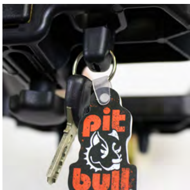
Integrated Key Holder