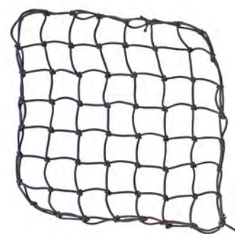
Optional Helmet Retaining Net