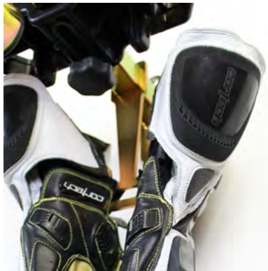
Optional Gloves Hanger Adapter (incl. w/ Elite Kit)