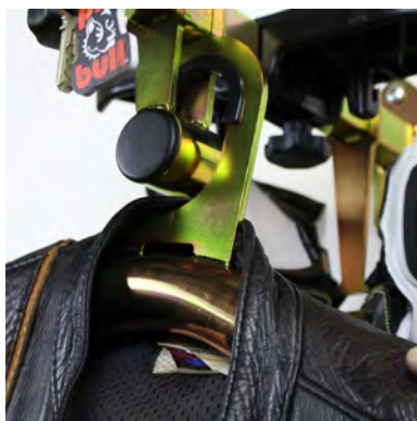
Optional Leathers Hanger Adapter (incl. w/ Elite Kit)