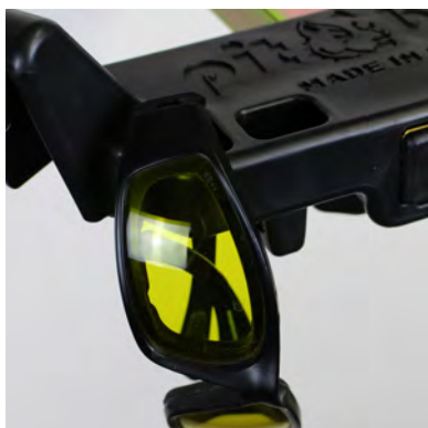
Integrated Riding Glasses Holder